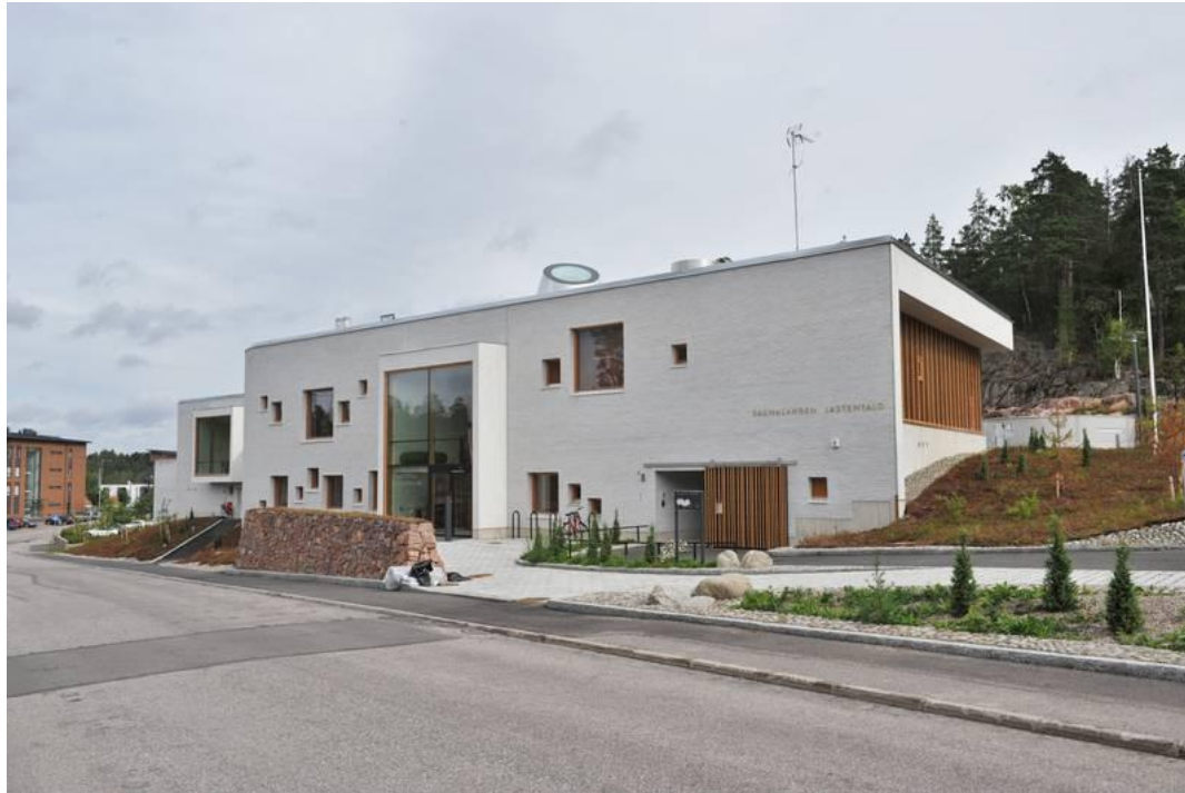
Saunalahti Children's House